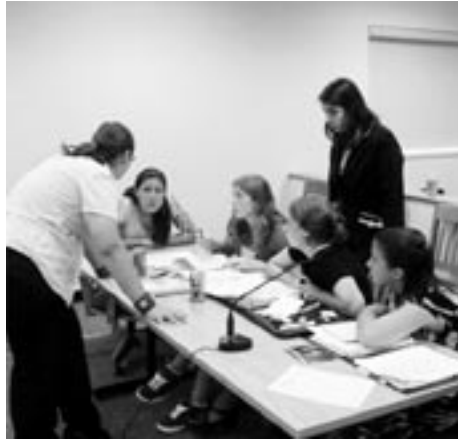
Students involved in the camp deliberating in a mock trial