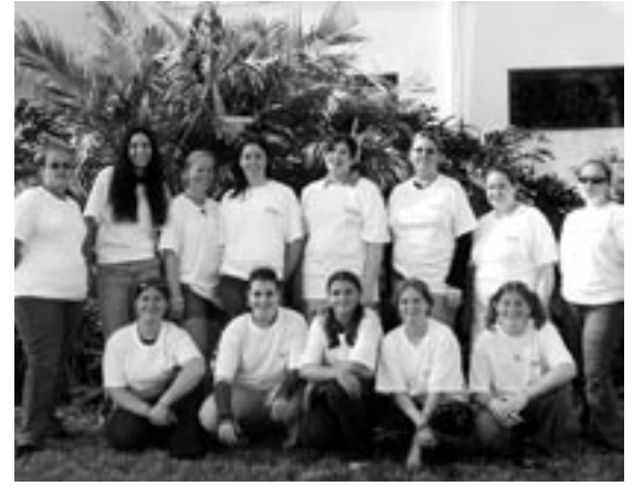
Students involved with the Florida Forensics Camp